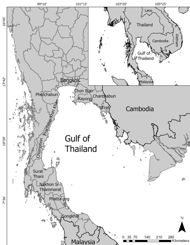
Figure 1. Map of the Gulf of Thailand bordering Cambodia on the southeast, and Malaysia on the southwest. Inset: Thailand regional view.

Nesting along the Andaman coast is mainly undertaken by olive ridleys (Settle 1995; Chantrapornsyl 1996; Aureggi 2010), although occasional reports of nesting leatherbacks, and more rarely hawksbills and greens, are provided to government agencies by local community members along this coast (Chantrapornsyl 1992; Chantrapornsyl 2000). Of all Thai waters, the Gulf of Thailand (GoT) (Fig. 1) is the area where the majority of hawksbill and green sea turtle nesting has historically occurred and been recorded