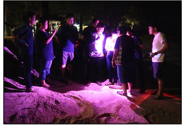
Figure 8. During a practice night beach patrol, accurate data recording with standard nesting beach data sheets was stressed in different night-time scenarios.