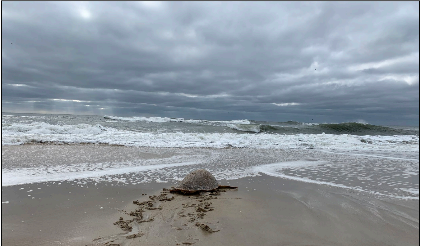
Juvenile loggerhead sea turtle released on the beach on South Core Banks, North Carolina, USA, after successful rehabilitation from cold-stunning.