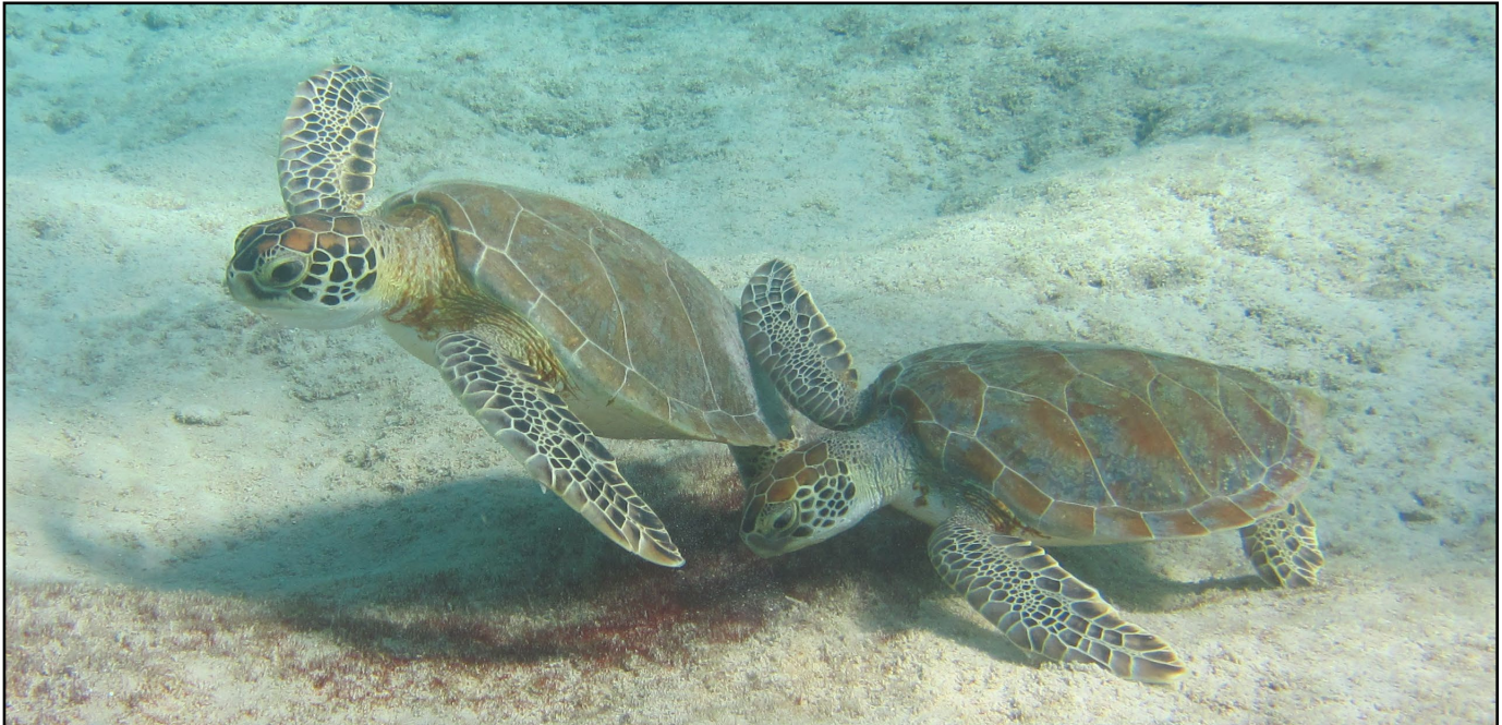
Green turtles “SAF” on left and “SX” on right at Salt Pier Bonaire, Dutch Caribbean. See pages 1-8.