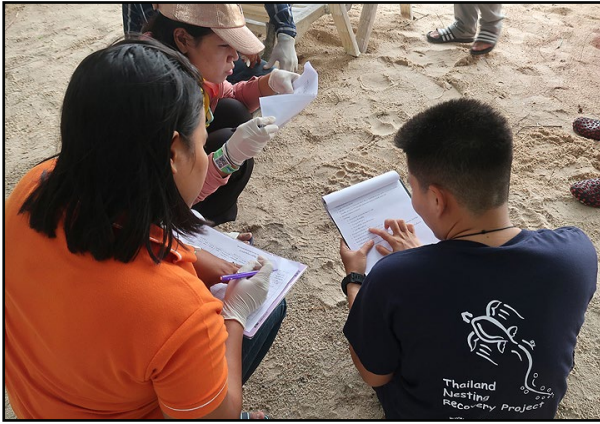
Figure 7. Workshop participants practice decision-making regarding relocating nests to higher-shore locations.